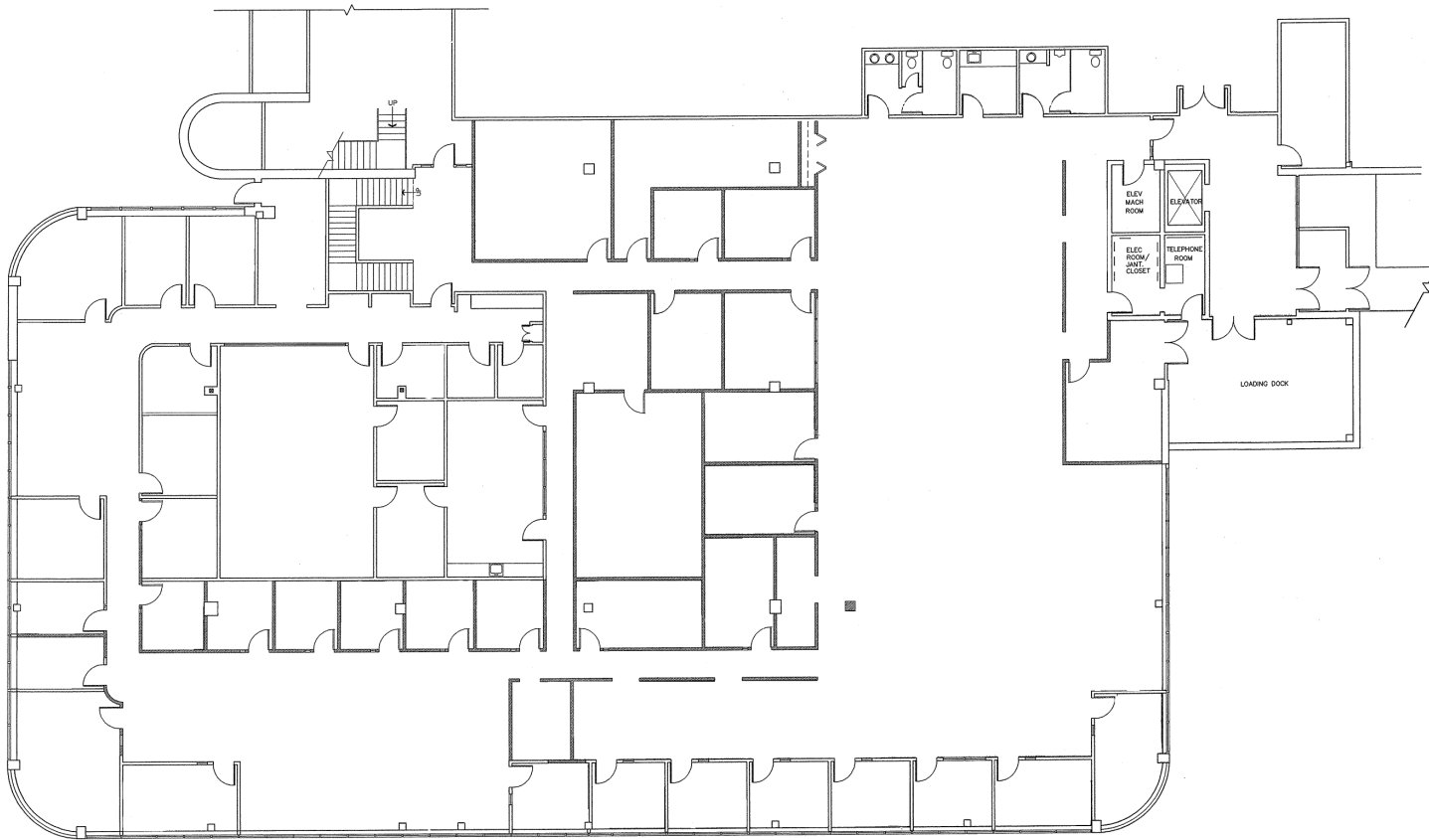
Floor Plan: Not to Scale